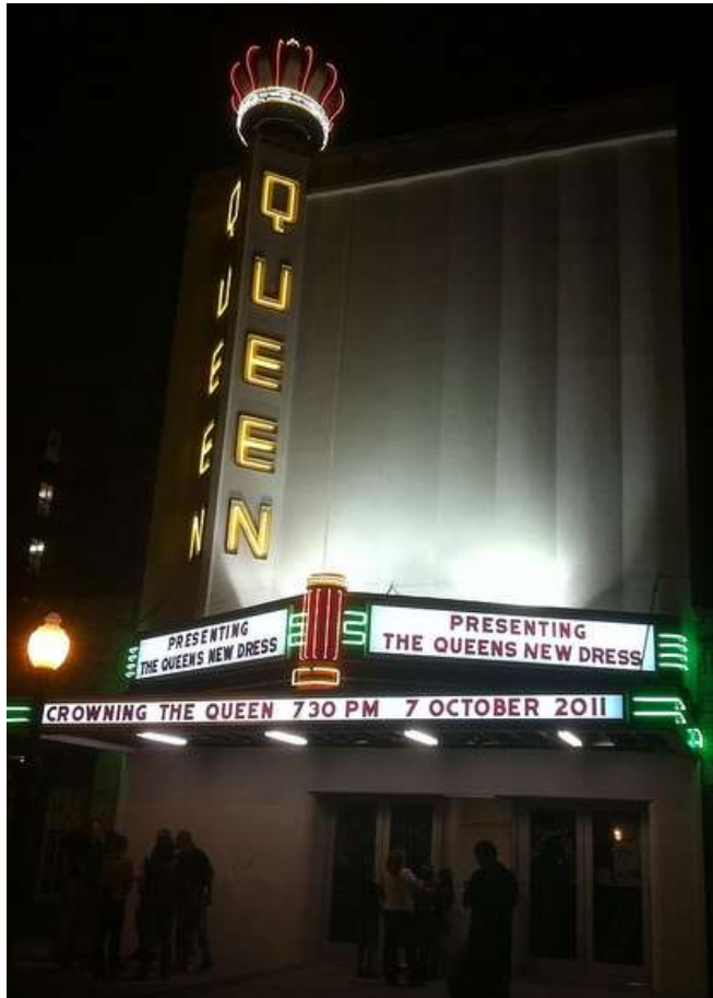
Downtown Bryan Cultural District